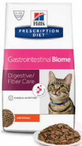
Also available as a stew