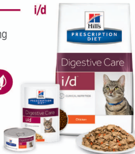
Also available as a stew

Available in dry and canned foods, a delicious pouch variety and irresistible stews.