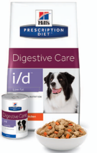
Also available as a stew