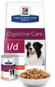
Also available as a stew